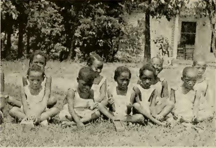
It's storytelling time at Holmes Galloway Ranch, Elroy, Arizona

does not mean that workers are not interested in buildings—but it does mean that when we start with the needs of people, the improvement of the physical aspects of the community becomes a very real part of the program of work. In a very literal sense the worker actually works toward the time she will no longer be needed in a community—because leadership has been developed and co-operative processes have been set on foot which among other things will make for improvements in building and equipment belonging not to a board or to a conference, but to the people of the local community themselves.